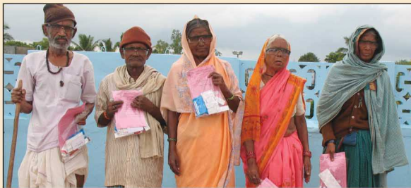
5 of Our Leprosy Patients who Underwent Cataract Surgery

By God's grace although it came late we had very good rains this year and the well in Baridabad is full. 5 of the residents of NJLC have undergone cataract surgery in Sep'08.