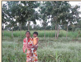
The Farm in Baridabad