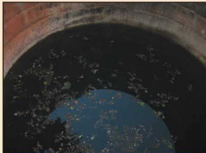
Our Well in Baridabad Full of Water