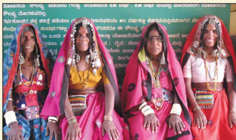
Some of our beautiful Lambani Patients

We gave a face lift to the hospital and the renovated premises looks really nice. We changed the staff supervisors and so they are working well and efficiently