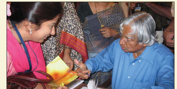
With Ex President of India Dr. APJ Abdul Kalam

I had the privilege of meeting Ex. President of India APJ Abdul Kalam at the Vision 2020 meet at Jodhpur in Jul'08