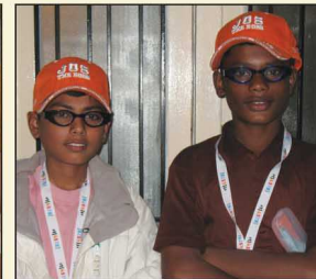
Children Wearing U-specs